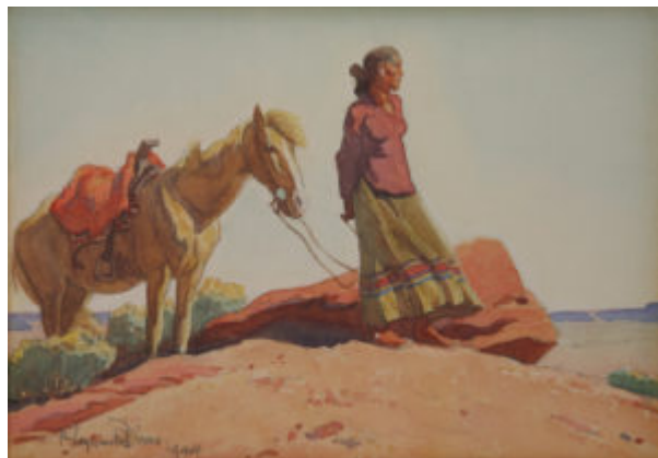
Image: © Maynard Dixon, Navajo Woman , 1944, watercolor, 7 x 10", Mark Sublette Medicine Man Gallery & Maynard Dixon Museum Tucson