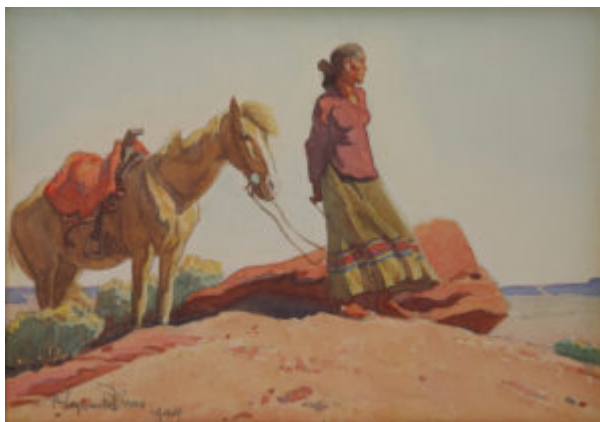
Image: © Maynard Dixon, Navajo Woman , 1944, watercolor, 7 x 10", Mark Sublette Medicine Man Gallery & Maynard Dixon Museum Tucson