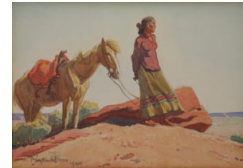
Image: © Maynard Dixon, Navajo Woman , 1944, watercolor, 7 x 10", Mark Sublette Medicine Man Gallery & Maynard Dixon Museum Tucson