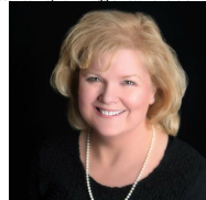
Photo will follow.