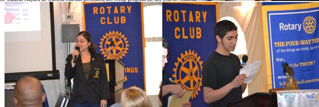
2018 District Conference Rotaract April 26-29, 2018