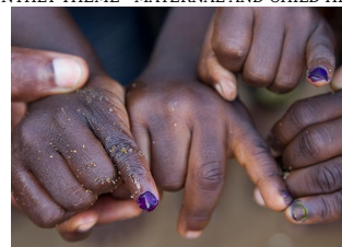
From Rotary International website:

If you are unable to serve as a greeter or give the invocation, please be responsible for finding a replacement.