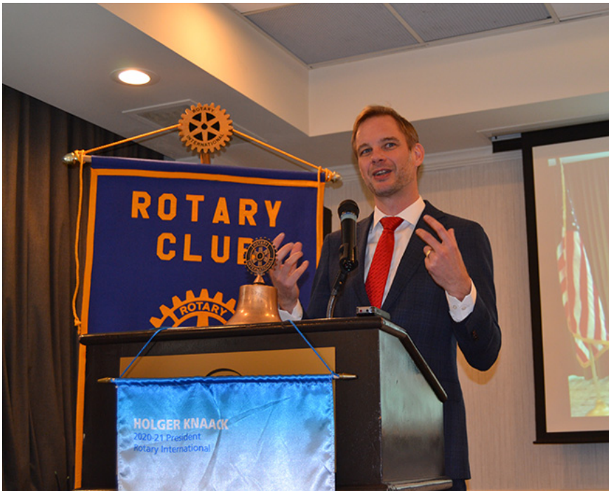
In photo: Michel Gerebtzoff, the Consul General of the Kingdom of Belgium.