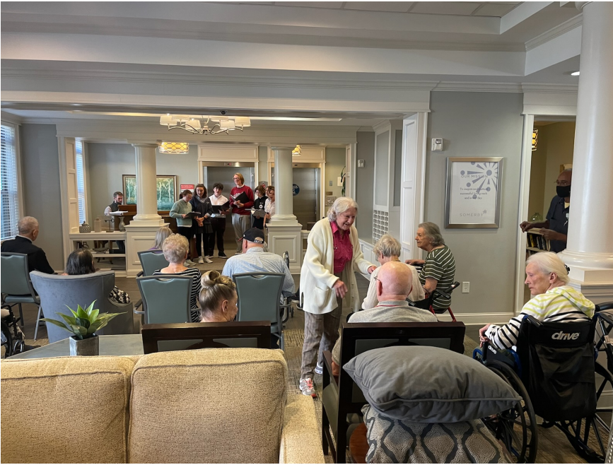
This enthusiastic group of students, grades 6 through 12, from Mt. Vernon Presbyterian School played the guitar, piano, and drums as they sang pop and traditional songs.