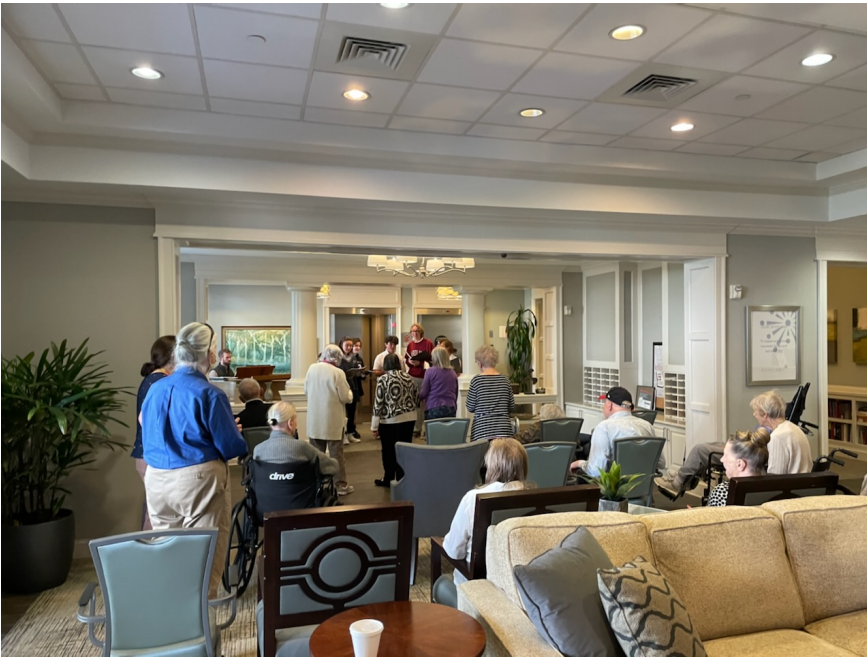
The appropriate Elvis tune, "I cannot stop loving you " lead off. Singing through a repertoire of pop and traditional songs the seniors who could stand were dancing in the aisles. The Vernon Vocals ended with the Abba song, "Dancing Queen". To thank these students, Rotary treated the Vernon Vocals to a pizza party at the school on October 5th.